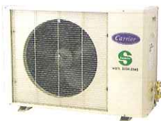
◀ 38RE-G2 Series

Carrier reserves the right to make changes in specifications without prior notice. บริษัทฯ ขอสงวนสิทธิ์ที่จะเปลี่ยนแปลงรายละเอียดข้างต้น โดยไม่ต้องแจ้งให้ทราบล่วงหน้า